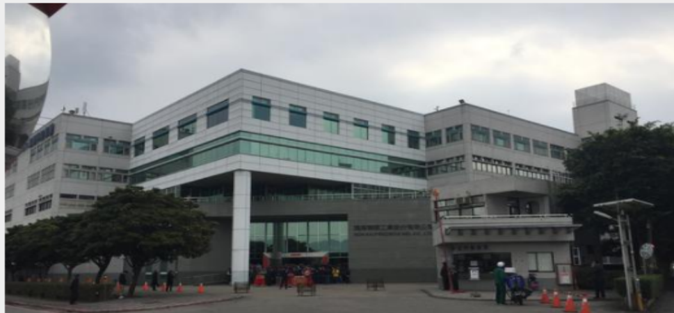
Foxconn's headquarters in suburban Taipei

TAIPEI -- Key iPhone assembler Hon Hai Precision Industry , also known as Foxconn Technology Group, said that PC giant Dell and memory maker Kingston Technology will join Apple and Amazon in backing his company's bid for the memory chip unit of embattled Japanese conglomerate Toshiba .